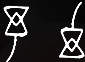
篆书 / Seal Character

幻。《说文》：相诈惑也，胡辨切。从反予，使彼予我是为幻化。《列子》曰：有生之气，有形之状，尽幻也。穷数达变，因形移易者，谓之化，谓之幻。造物者其巧妙，其功深，固难穷难终。因形者其巧显，其功浅，故随起随灭。